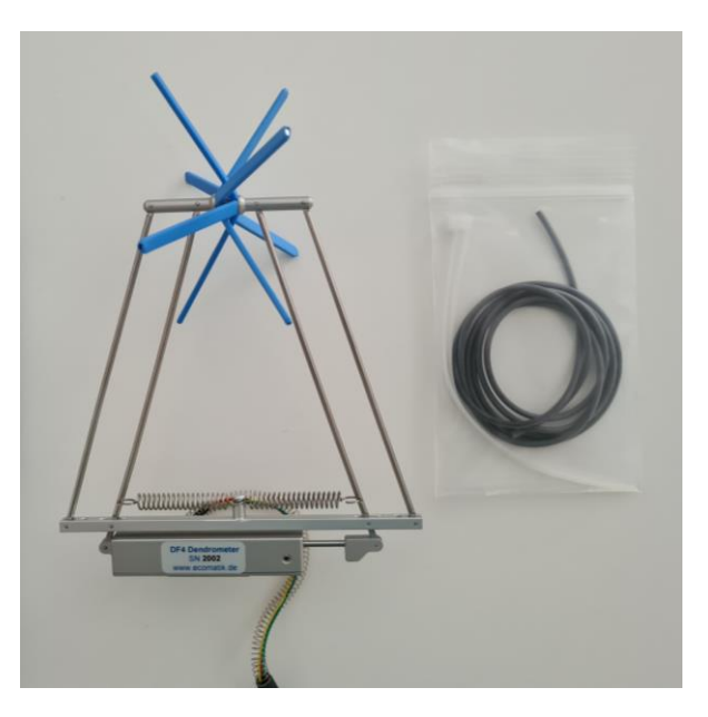
DF4 Fruit Dendrometer

1x Piece re-usable UV-resistant rubber reusable to fix the sensor cable at the branch/stem for strain relief.