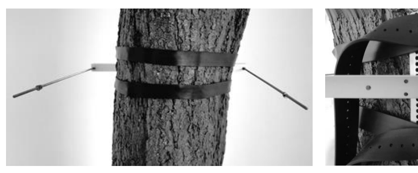
Front side Back side